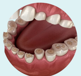
Tooth erosion can be seen on these lower teeth